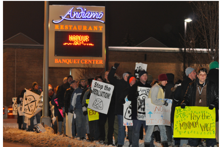
ROC-Michigan protest outside Andiamo restaurant in Dearborn.

ROC (Restaurant Opportunities Center) has been very active in bettering restaurant working conditions since starting its Michigan chapter in 2008. In January, GEO organization joined forces with ROC to take on the local restaurant chain, Andiamo, who was singled out for its particularly egregious violations of labor laws. The management had been discriminating on the basis of race, nationality, and gender, in addition to violating overtime and minimum wage laws. Members of GEO have been participating in weekly protests, putting increasing pressure on the owners and management to mend their ways. Recently, our union even rolled out its drum corps in order to make our presence impossible to ignore. Our efforts have already met with success. The restaurant began meeting its obligation to pay overtime this month. In addition, on February 12th, workers filed a federal lawsuit for $125,000 in back wages.